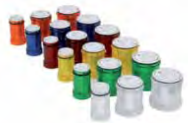
AVAILABLE IN SIX COLORS