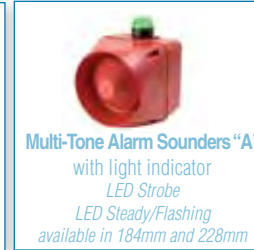
Multi-Tone Alarm Sounders "A" with light indicator LED Strobe LED Steady/Flashing available in 184mm and 228mm