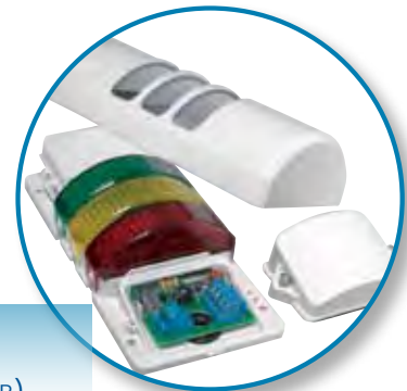
EASY ELECTRICAL CONNECTION (TERMINALS, REMOVABLE COVER)