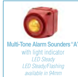
Multi-Tone Alarm Sounders "A" with light indicator LED Steady LED Steady/Flashing available in 94mm