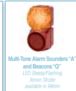
Multi-Tone Alarm Sounders "A" and Beacons "Q" LED Steady/Flashing Xenon Strobe available in 94mm