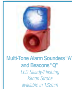
Multi-Tone Alarm Sounders "A" and Beacons "Q" LED Steady/Flashing Xenon Strobe available in 132mm