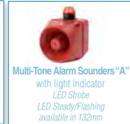
Multi-Tone Alarm Sounders "A" with light indicator LED Strobe LED Steady/Flashing available in 132mm