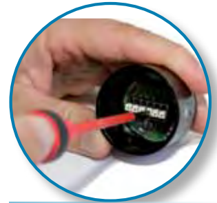
TERMINALS WITH EASY PUSH-IN CONNECTIONS