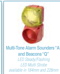
Multi-Tone Alarm Sounders "A" and Beacons "Q" LED Steady/Flashing LED Multi Strobe available in 184mm and 228mm