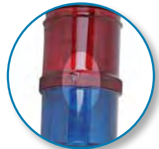
EASY “NO TOOLS” TWIST ON LOCKING SYSTEM