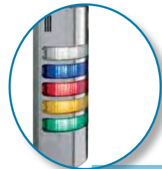
SLIM DESIGN, ONLY 45MM WIDE FOR OPTIMAL INTEGRATION