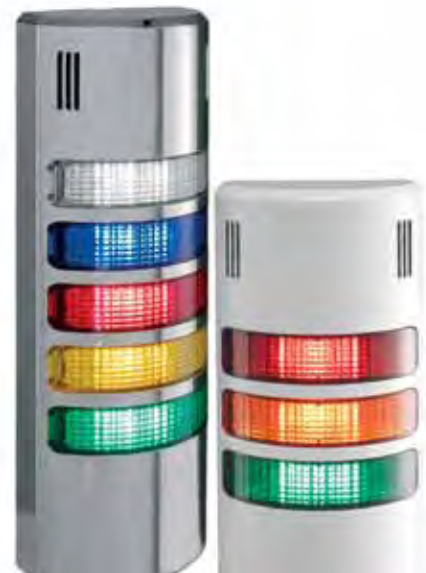
available in 3 casing colors: silver, white and black