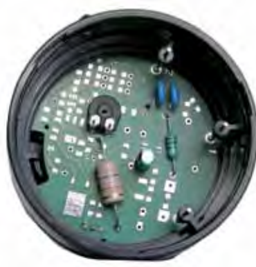
XDZ Continuous & Pulsing Tone (Dual Circuit)