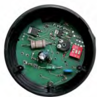
XDM 1-8 Tones (Single Circuit)