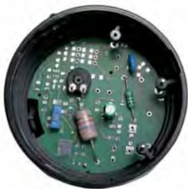
XDE Continuous/Pulsing Tone (Single Circuit)