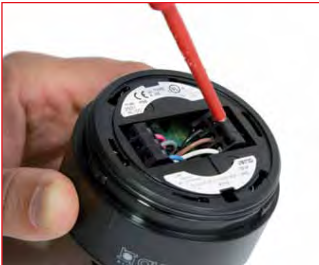
Screwless terminal connection (ECOmodul 60 and 70)