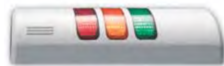
slim design, only 45 mm wide for optimal integration/combination of signal tower unit in machine/panel building or other (building) applications